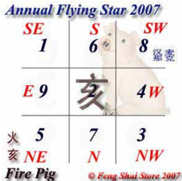
2007 Fire Pig/Boar (Ding Hai) Year